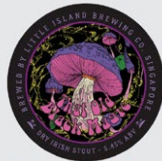
That Old Black Magic Dry Irish Stout