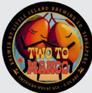
Two To Mango Mango Wheat