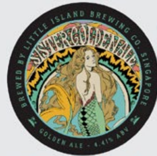
Sister Golden Ale Golden Ale