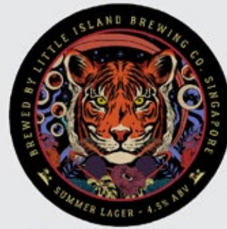
Eye Of The Lager Summer Lager