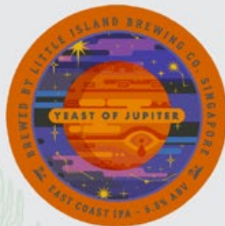
Yeast of Jupiter East Coast IPA