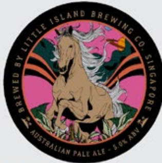
A Oz With No Name Australian Pale Ale