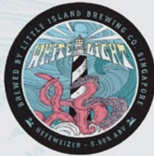
White Light Hefeweizen