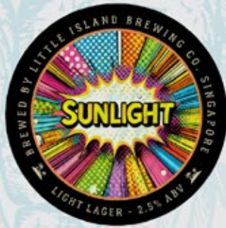
Sunlight Light Lager