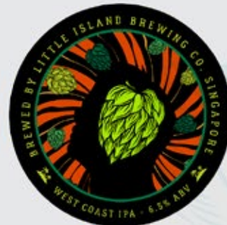
Vertigo West Coast IPA

*Please check with our staff for stock availability