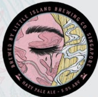
Miss U Like Hazy Hazy Pale Ale