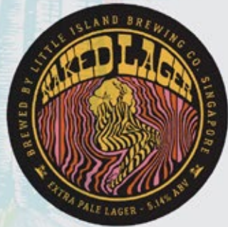
Naked Lager Extra Pale Lager