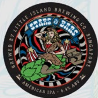
Stars & Bars American IPA