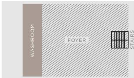
Grand Ballroom - Level 1